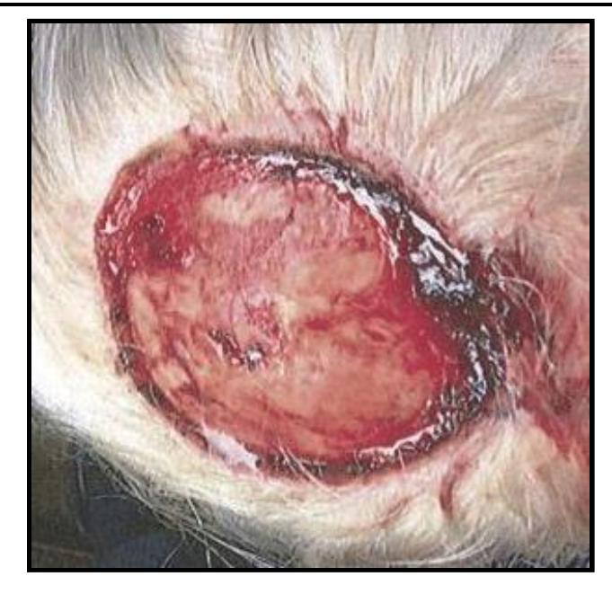
Initial Wound Exam : Full-thickness non-healing post-Mohs surgical scalp wound, initial area measured to be 6.8 x 7.6 x 1.0cm. Moderate amount of bloody exudate (sanguineous) with exposed bone and defined wound margins.