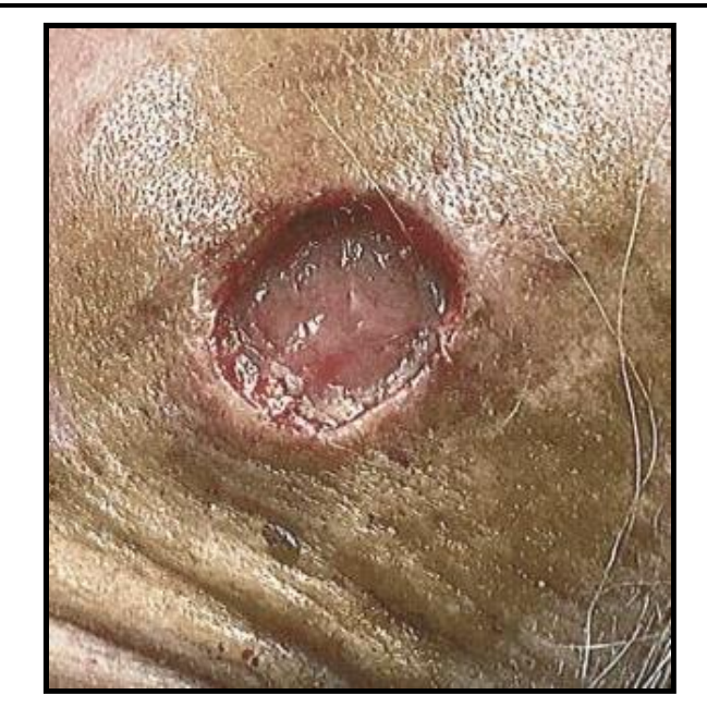
Week 2 Follow-Up: One-week follow-up after initial treatment with reapplication of graft: wound exudate is minimal, and clear. Slightly edematous wound border with beginnings of tissue granulation. The full wound coloration is red border with pink tissue center, without any indication of infection.